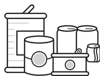
Metal & Aluminum